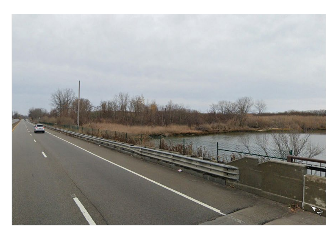
Current View from North Bridge