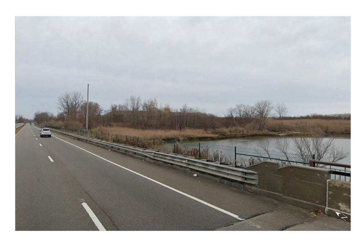
Projected View from North Bridge